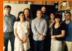
Our team (Geneva and Paris)

Millions of others are waiting for your support